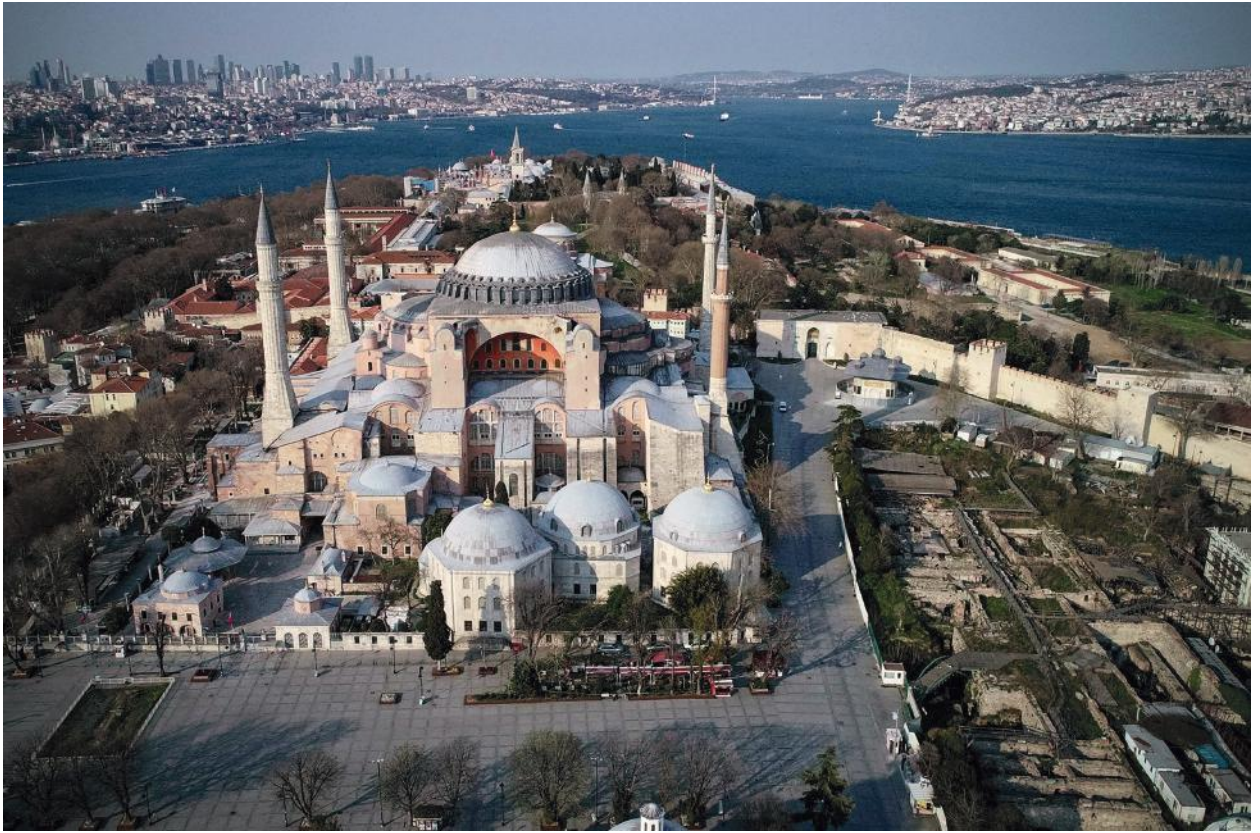
Fig. 3. Hagia Sophia and the year of the coronavirus.

See: URL: https://www.dailysabah.com/arts/hagia-sophia-the-treasure-of-sultan-mehmed-the-conqueror/news