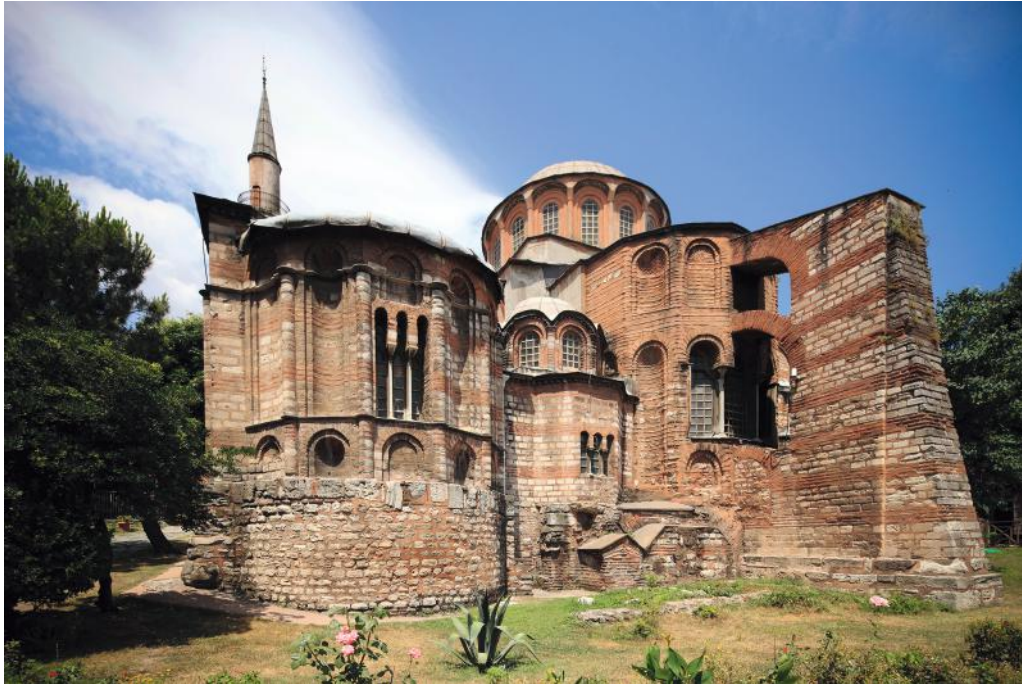
Fig. 7. Former Chora Church, since Aug 21st 2020 the Kariye Mosque. See: URL https://www.lonelyplanet.com/turkey/istanbul/attractions/kariye-museum-chora-church/a/point-sig/402174/360887

man who made Hagia Sophia a mosque. Certainly, while Mustafa Kemal would not have approved of President Erdoğan's modus operandi (based, it seems, on systemically alienating one part of the country while securing the whole-hearted support of the other 27 ), it is disingenuous to believe he would have been surprised by it. Over the past century, Turkey sadly failed to notably close the income gap with developed economies — to quote [Pamuk, 2007], “The income per capita gap between Turkey and the high income countries of Western Europe and North America was about the same in 2005 as it was on the eve of World War I”. And it was prosperity that Atatürk wanted for his citizens first, not irreligiosity (this was to be a matter of personal choice): Where economic disenfranchisement rules the day, religion predictably rises to fill in the void,