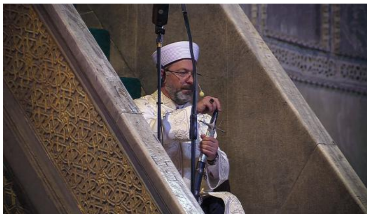
Fig. 6. Dr Ali Erbaş delivering a sermon on Hagia Sophia's conversion to mosque. Photo © DHA. See: URL: https://www.dailysabah.com/politics/sermons-with-swords-part-of-turkeys-tradition-head-of-diyamet-says/news

terested in an abstract brave new world and instead always had in front of him the society towards which he wanted Turkey to evolve: Europe. In that particular resolve, importantly, he wasn't categorically different from the Ottoman reformers who predated him by half a century or more. He was simply more efficient and — through the circumstances that forged him as one of the foremost statesmen of the 20 th century — not a hostage to outdated institutions, expectations, and customs.