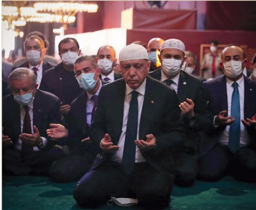
Fig. 4. President Erdoğan.

See: URL https://www.theguardian.com/world/2020/jul/24/erdogan-prayers-hagia-sophia-museum-turned-mosque