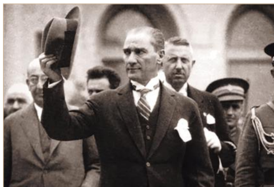
Fig. 5. President Atatürk